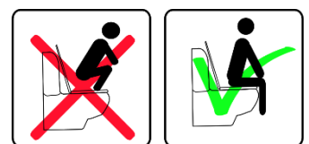
How to Use a Toilet - Openclipart

➡ if you don't, you might lose your apartment and be fined for the damages