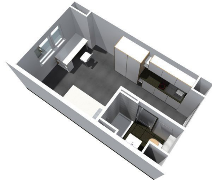
Student apartment in Schönecker dormitory