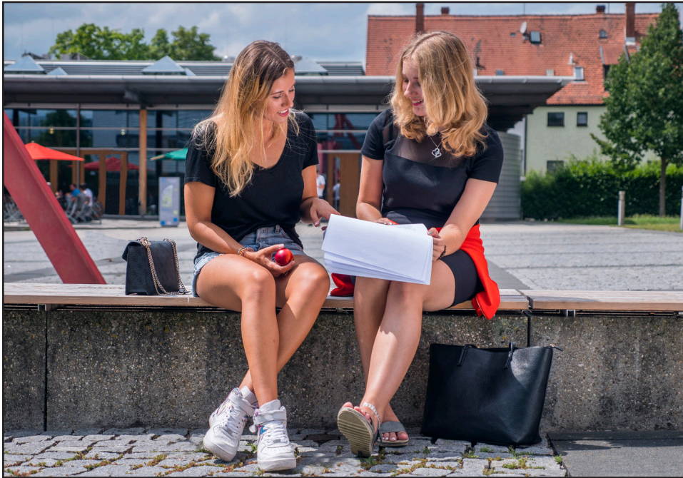
International students at Hochschule Ansbach