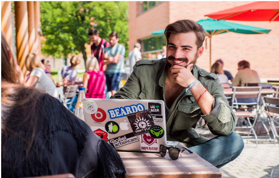
Outside of Mensa